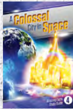
Study Guide 4: A Colossal City in Space