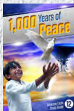
Study Guide 12: 1,000 Years of Peace