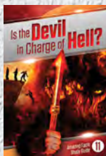
Study Guide 11: Is the Devil in Charge of Hell?