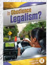
Study Guide 14: Is Obedience Legalism?

When you have completed the first 14 Study Guides, ask about our advanced set by writing: