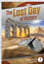
Study Guide 7: The Lost Day of History