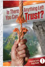
Study Guide 1: Is There Anything Left You Can Trust?

Each lesson is filled with amazing facts that will transform you and your family and bring you lasting hope. Don't miss a single one!