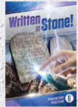
Study Guide 6: Written in Stone!