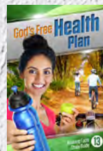
Study Guide 13: God's Free Health Plan