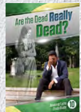
Study Guide 10: Are the Dead Really Dead?