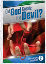
Study Guide 2: Did God Create the Devil?