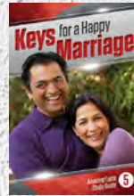
Study Guide 5: Keys for a Happy Marriage