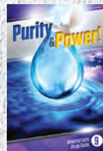
Study Guide 9: Purity & Power!