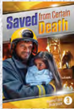
Study Guide 3: Saved from Certain Death