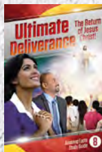
Study Guide 8: Ultimate Deliverance