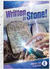
Study Guide 6: Written in Stone!