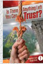
Study Guide 1: Is There Anything Left You Can Trust?

Each lesson is filled with amazing facts that will transform you and your family and bring you lasting hope. Don't miss a single one!