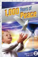
Study Guide 12: 1,000 Years of Peace