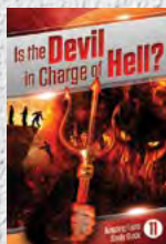
Study Guide 11: Is the Devil in Charge of Hell?