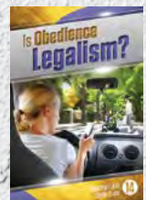
Study Guide 14: Is Obedience Legalism?

When you have completed the first 14 Study Guides, ask about our advanced set by writing: