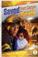
Study Guide 3: Saved from Certain Death