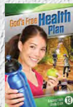
Study Guide 13: God's Free Health Plan