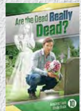
Study Guide 10: Are the Dead Really Dead?