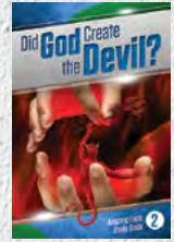
Study Guide 2: Did God Create the Devil?