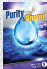
Study Guide 9: Purity & Power!