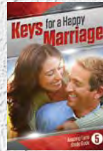
Study Guide 5: Keys for a Happy Marriage