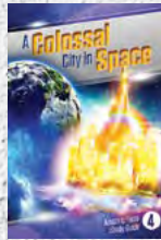
Study Guide 4: A Colossal City in Space