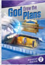
Study Guide 17: God Drew the Plans