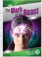
Study Guide 20: The Mark of the Beast