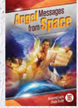
Study Guide 16: Angel Messages from Space