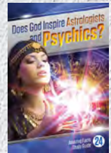
Study Guide 24: Does God Inspire Astrologists and Psychics?