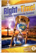
Study Guide 18: Right on Time!