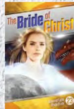
Study Guide 23: The Bride of Christ