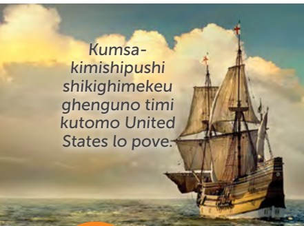
Kumsa-kimishipushi shikighimekeu ghenguno timi kutomo United States lo pove.

1798 zuu kukuhou lo amikucho lono pulu chekemi akukuhou kumtsu lo kutomo aqhe. Tishi aghie pinamu akukuhou tipaqo ye Ado kikishekha (end time) kukuhou shimlakepu shive, kughengu ado kishekha kukuhou ye AD. 1798 thiuno hiyam tsa shi aqoaho shieno puthulukeye kukuhou pesu Jisu no Pa kukuhou ipi ku ke ghenguno.