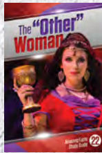
Study Guide 22: The "Other" Woman