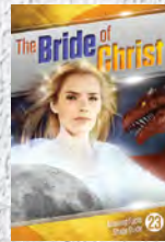
Study Guide 23: The Bride of Christ