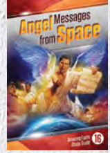
Study Guide 16: Angel Messages from Space