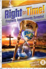
Study Guide 18: Right on Time!