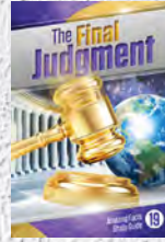
Study Guide 19: The Final Judgment