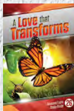
Study Guide 26: A Love that Transforms