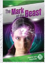
Study Guide 20: The Mark of the Beast