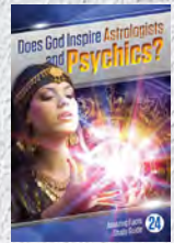
Study Guide 24: Does God Inspire Astrologists and Psychics?