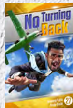
Study Guide 27: No Turning Back

Have you seen our first 14 Study Guides? If not, be sure to write to: