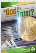
Study Guide 25: In God We Trust?