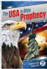
Study Guide 21: The USA in Bible Prophecy