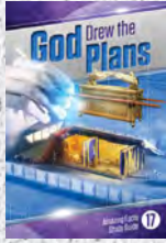
Study Guide 17: God Drew the Plans