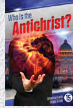
Study Guide 15: Who Is the Antichrist?

Each Study Guide is filled with amazing facts that will affect you and your family. Don't miss a single one!